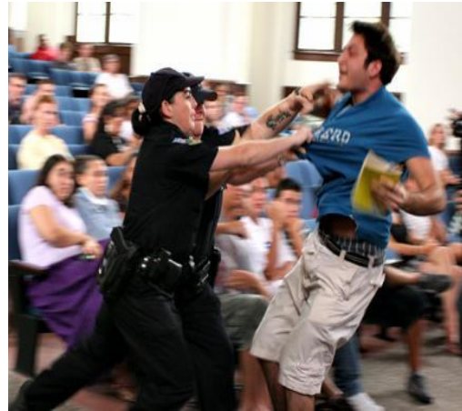
That's not nice!

Why? Five officers against one man, they obviously had the manpower to arrest him peacefully, but to add emphasis, Tasered him instead. Sure he was resisting arrest, but he shouldn't have been arrested anyway. How was his talking in a forum "disturbing the peace"?