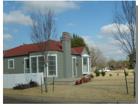
Bush's Midland, TX home

Bush was born to Former President George H.W. Bush and Barbara Bush on July 6, 1946. He was the first of six children. The Bush family moved to Midland, Texas and later relocated to Houston, Texas, where the President grew up.